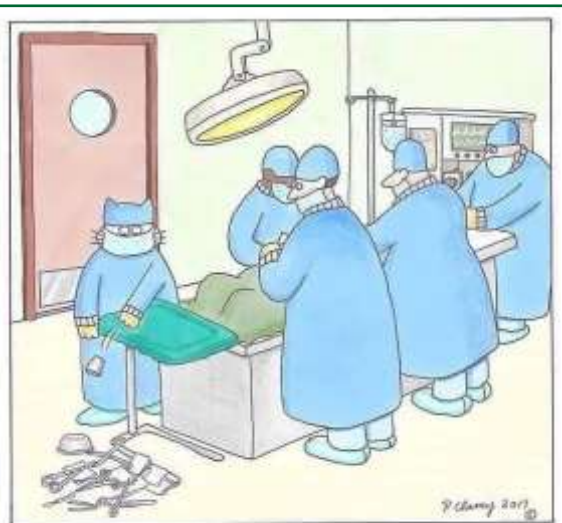
Why cats are not allowed in the operating room.

Applications are available online at: www.halfwayhomepetrescue.org/clinic